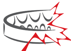
Roger Moody Promotions